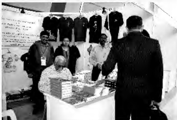
ENVIS staff promoting BUCEROS newsletter at the Conference

Following the huge success of the first such Conference in 2010, the Government of Gujarat in partnership with Federation of Indian Chambers of Commerce and Industry (FICCI), organised the 2nd Global Bird Watchers' Conference, 2012 from January 19-22, 2012, with which BNHS was involved as a knowledge partner. The Conference was attended by 360 delegates from 38 countries, including students, researchers, ornithologists, wildlife photographers, and amateur birdwatchers. A unique aspect of this Conference was a two-day field trip to various birding sites across Gujarat. The last day of